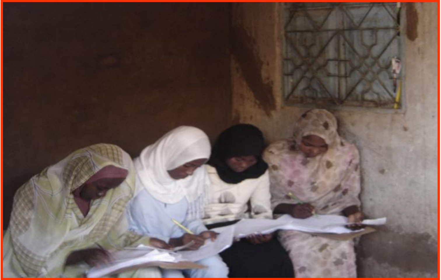
Peer – education